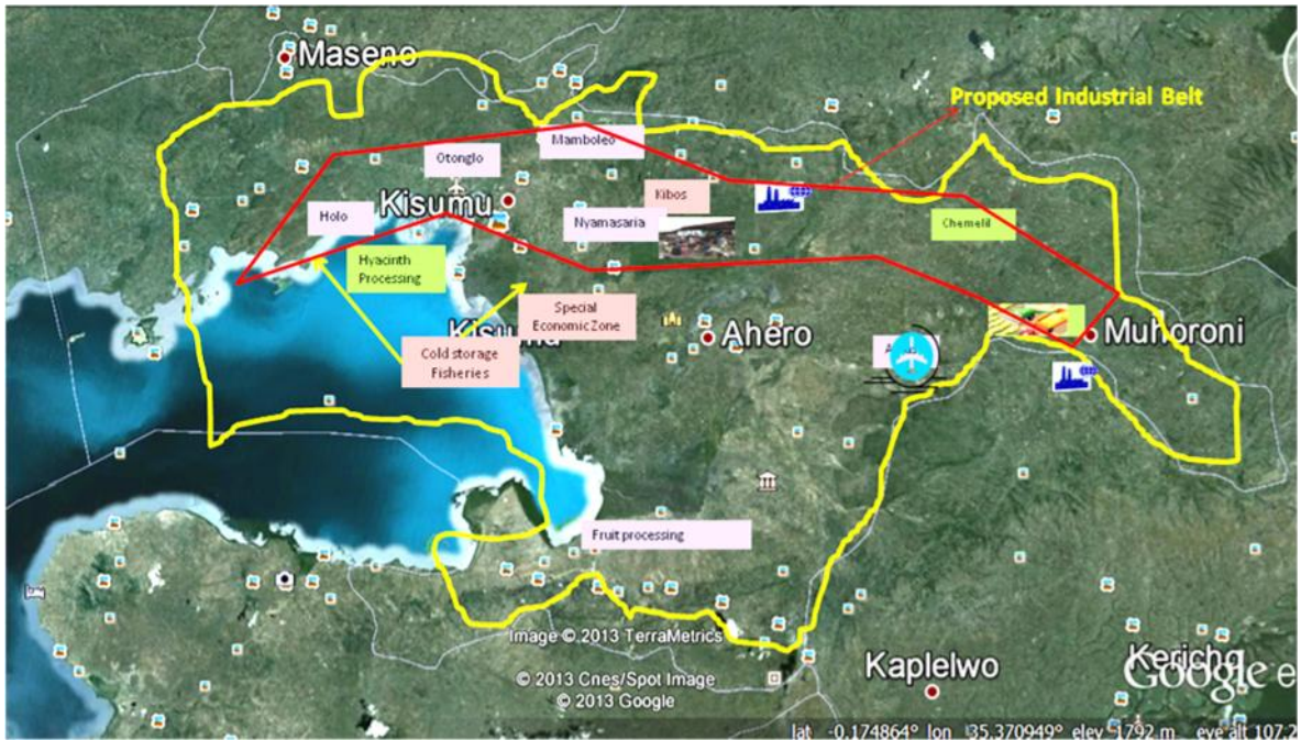
Plate 1: Industrial Belt in Kisumu County

major rivers in the County namely Nyando and Awach; improvement of lake transport and rail grid towards the industrial belt and connecting to the neighbouring counties; strengthening the satellite cities and supporting their specialization in terms of value addition and planning for the future airport to the south East of the County. There is also need to create an Economic Zone and more specifically a free trade area south of the County. Below is an illustration of centers of economic activities and the industrial belt.