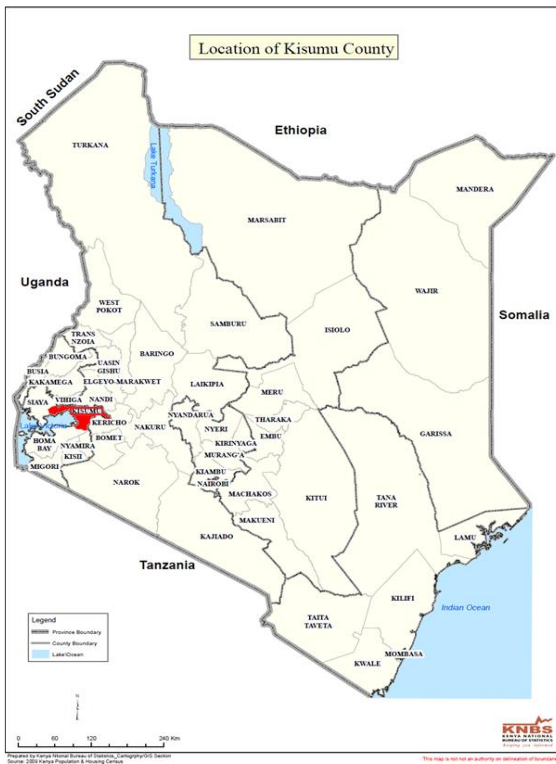
Map 1: Location of the Kisumu County in Kenya