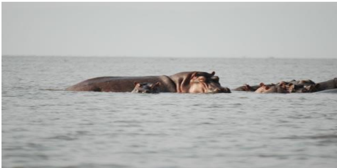
Figure 3: Hippos in Lake Victoria at Kiboko Bay

The main wildlife in the county are silver backed jackals, leopards, baboons, ostriches, hyena, guinea fowls, duikers, lion, impalas, vervet monkeys, bird species, sitatungas, crocodiles, pythons, monitor lizards, hippos, among others.