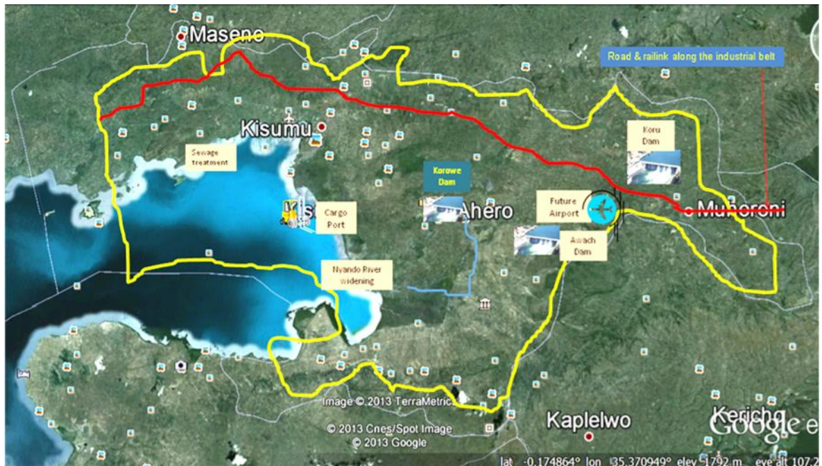
Plate 2: Road, Rail link and proposed Airport