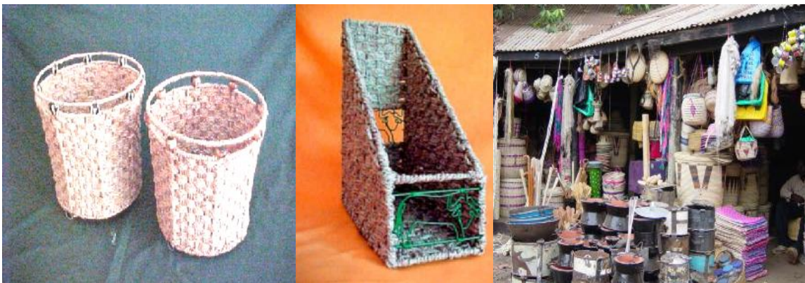
Figure 2: Some of the water hyacinth products

An integrated approach that combined physical, biological and mechanical methods is needed to contain the spread of water hyacinth. The weed is a problem because of the surprisingly long lifespan of its seeds which last as long as 30 years. It means seeds deposited near the shores in 1988 when the water hyacinth first appeared in the lake basin remain alive and will germinate when washed into the lake. Eradicating the water hyacinth is not possible; we can only manage it by reducing the coverage. Previous methods of control included the introduction of a weevil, and mechanical removal. At the latest attempt, the wind blew the weed to other parts of the lake before the firm that won the tender to remove it got down to work. One way of managing the weed is to make economic benefit out of it. There are several products that can be produced from the weed. Currently in the county, there are cottage industries that make furniture, baskets, mats, ropes and other artefacts from water hyacinth. There is also the potential for production of bio-energy, bio-fertilizer and animal feed from the weed.