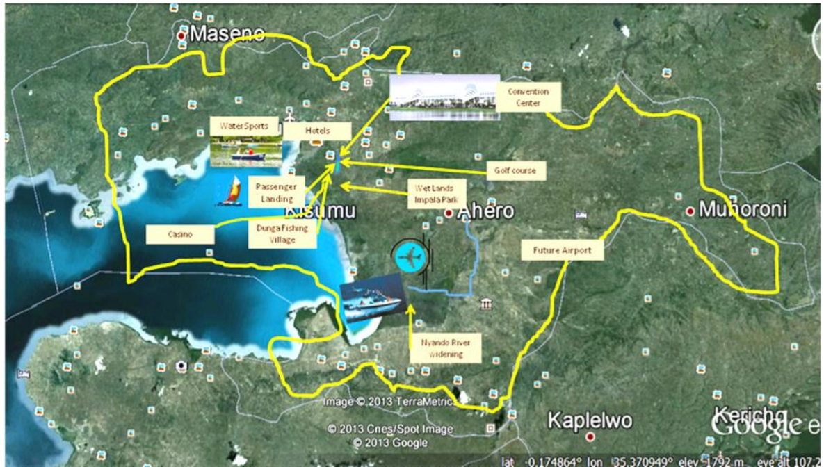
Plate 3: Tourist Attraction and proposed Facility Sites

The western sector has been identified as the next biggest driver of the tourism sector in Kenya. The County stands at an advantaged position in terms of positioning the as tourism destination. Kisumu County sits at the epicentre of all the tourist sites within the East African region with the ability of accessing all of them within a time limit of five hours at the maximum.