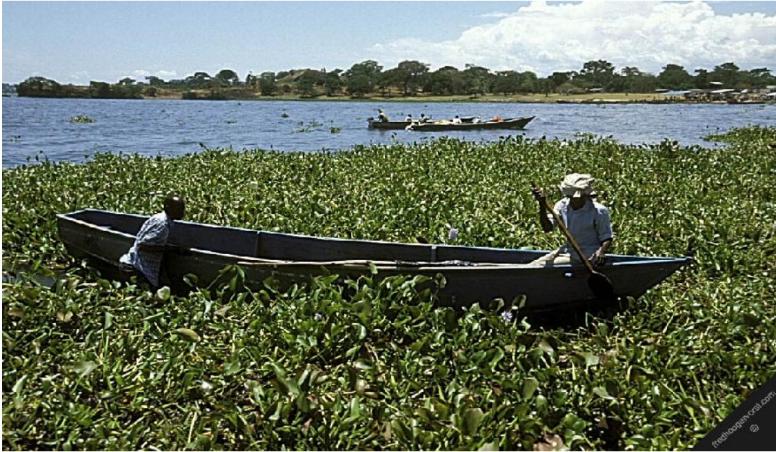
Figure 1: Water Hyacinth in Lake Victoria

An integrated approach that combined physical, biological and mechanical methods is needed to contain the spread of water hyacinth. The weed is a problem because of the surprisingly long lifespan of its seeds which last as long as 30 years. It means seeds deposited near the shores in 1988 when the water hyacinth first appeared in the lake basin remain alive and will germinate when washed into the lake. Eradicating the water hyacinth is not possible; we can only manage it by reducing the coverage. Previous methods of control included the introduction of a weevil, and mechanical removal. At the latest attempt, the wind blew the weed to other parts of the lake before the firm that won the tender to remove it got down to work. One way of managing the weed is to make economic benefit out of it. There are several products that can be produced from the weed. Currently in the county, there are cottage industries that make furniture, baskets, mats, ropes and other artefacts from water hyacinth. There is also the potential for production of bio-energy, bio-fertilizer and animal feed from the weed.