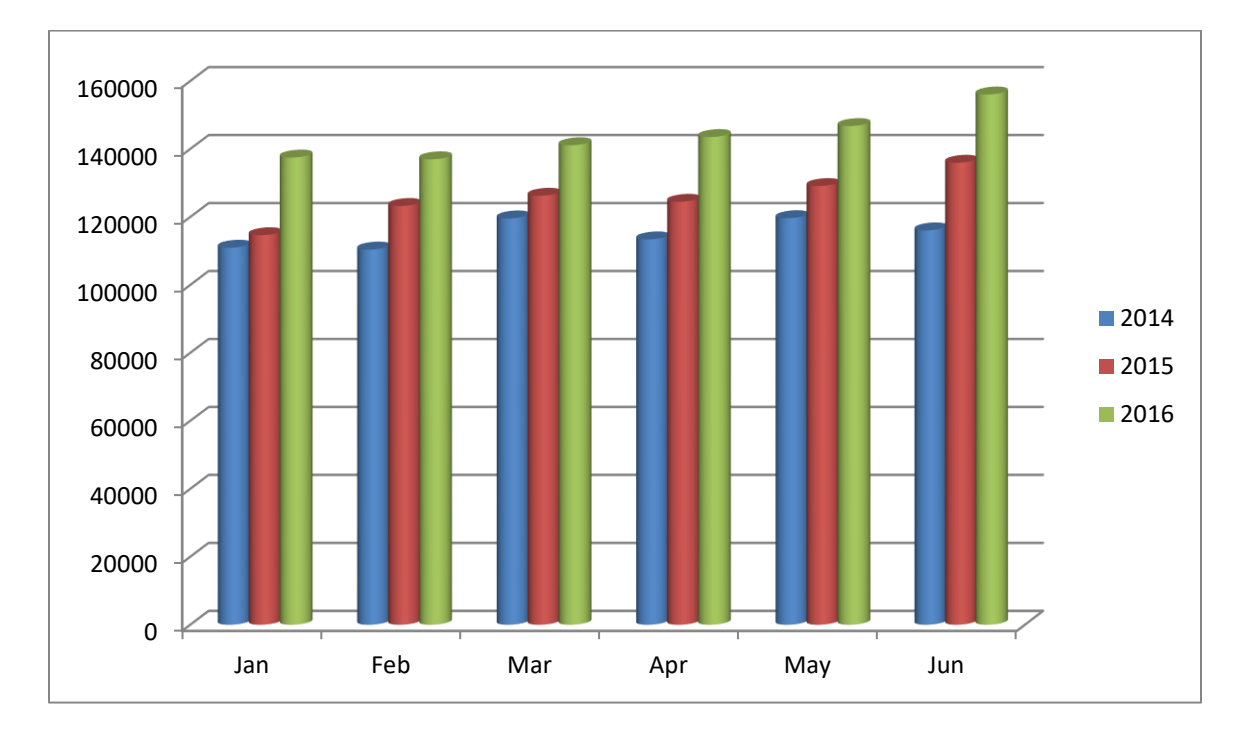
Figure 2.2: Remittance inflow in USD in millions in first half of 2014, 2015 and 2016

29. To encourage remittances in the County, the Diaspora has been advised to form a SACCO (Kisii County Diaspora SACCO) whose membership intends to be the Diaspora. The SACCO intends to manage their properties and investments. Some of the Diasporas have been swindled by their kinsmen in the past. This because the family members they often engage in managing their properties do not have adequate skills and necessary expertise required in managing investments. The formation of the SACCO intends to not only benefit the Diasporas but the County Government as well. The SACCO intends to create a forum for the government to engage the diaspora in development activities through the platform for PPP.