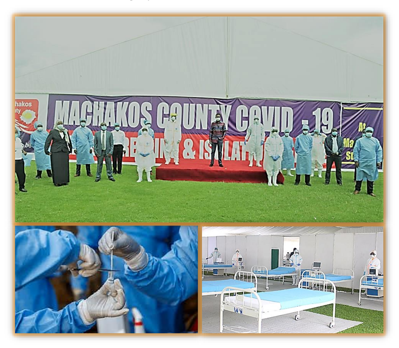
Machakos County Covid 19 mass testing and isolation centre, Kenyatta stadium

This sector plays a vital role in maintaining a healthy population that is useful in helping the County realize her agenda. Some of the key developments that have been implemented to improve access to and provision of quality healthcare services within the county include ongoing construction of 40 community hospitals, face lifting of primary health care facilities, strengthening of the referral system through purchasing of 70 ambulances and massive recruitment of health workers across the county.