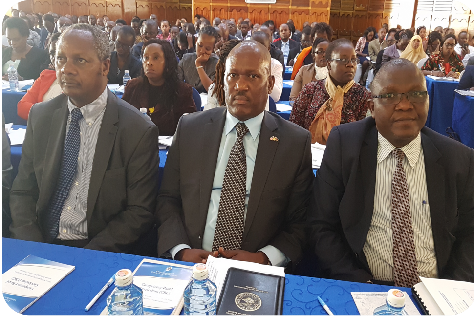
Figure 1: Validation forum for the Draft 2019 President's Report