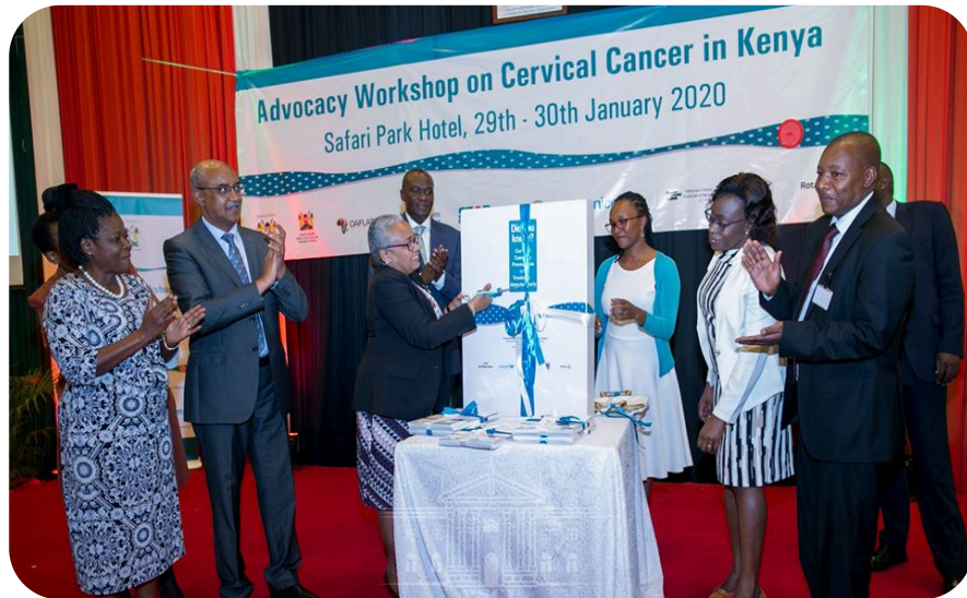
Figure 9: H.E the First Lady launching the Advocacy Guide for Eliminating Cervical Cancer

for Eliminating Cervical Cancer to empower and sensitize communities on cervical cancer prevention. H.E the First Lady also flagged off the Beyond Zero 100 Men Run at Karura Forest where men participated in the race dubbed I will run for Her . The event sensitized men on; healthy lifestyle for the elderly, maternal health, zero new HIV infections, early screening for cancer, zero FGM, zero child deaths, zero child marriage, zero maternal death and inclusion of persons who are differently-abled.