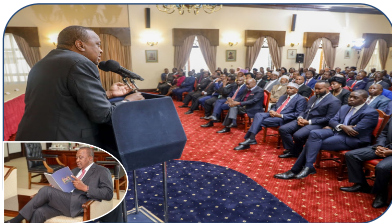
Figure 13: H.E the President addressing Governors and Senators on the BBI

572.H.E. the President received the Building Bridges Initiative Taskforce report in November, 2019. The report contained views from more than 7,000 citizens drawn from all ethnic groups, gender, cultures, religions and other diverse socio-economic sectors. Further, the report contained opinions from more than 400 elected leaders, 123 individuals representing major institutions both corporate and public, 261 memoranda and 755 handwritten submissions.