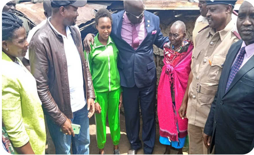
Figure 10: Education CS leading a campaign on 100% transition to secondary school