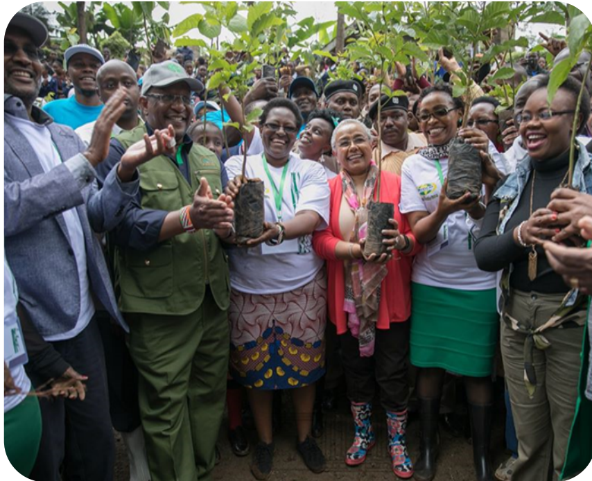
Figure 5: H.E the First Lady presiding over tree planting