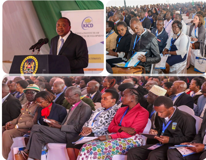
Figure 11: The 3 rd National Curriculum Conference