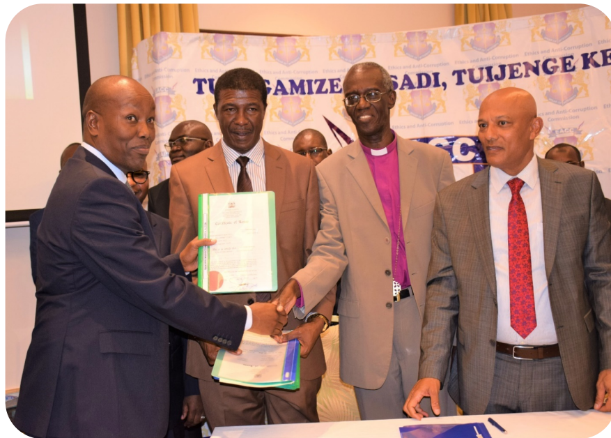
Figure 3: EACC Chair handing over title deeds of recovered public land to Nakuru County Governor