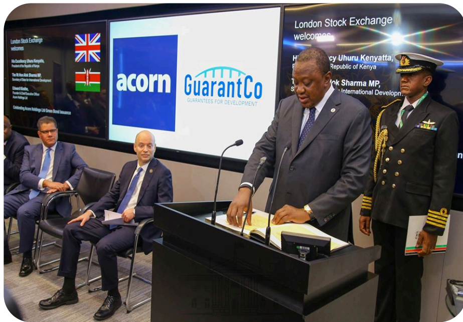
Figure 6: H.E. the President addressing the UK-Africa Summit