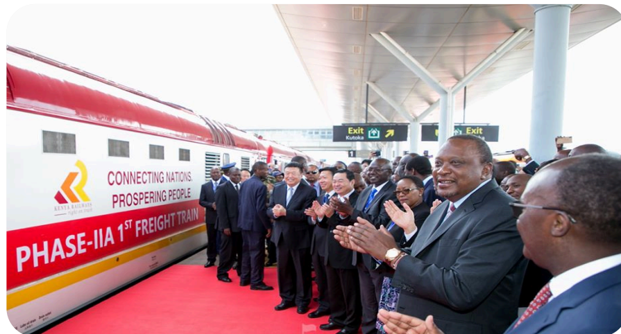
Figure 2: Launch of the SGR Phase IIA Nairobi-Suswa