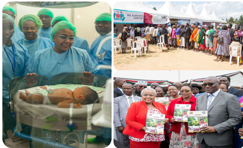
Figure 15: Beyond Zero Campaign initiatives

657. To enhance the right to healthcare services, the Office of the First Lady launched the 3 rd and 4 th Beyond Zero Medical Safaris in West Pokot and Nyandarua counties that offered medical services to more than 50 women with fistula challenges. In addition, H.E. the First Lady commissioned the new 64 bed mother and child wing at Engineer County Hospital, Nyandarua County at a cost of KSh.57Million. Further, H.E. the First Lady commissioned a specialized maternity theatre and neonatal unit with 20 incubators, 20 cots and medical equipment worth KSh.200Million at Kapkatet Hospital in Kericho County to enhance provision of quality health care services for mothers and premature babies.