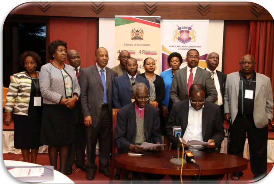
Figure 16: EACC Chairperson, Commissioners and Governors during the consultative forum on corruption prevention in county governments

798. To enhance transparency and accountability in the public sector, EACC reviewed institutional systems, policies, procedures and methods of work for 7 MCDAs and recommended measures to seal the identified corruption loopholes. The Commission developed 2 technical advisories for corruption prevention in ICT and records management across the public sector, trained 893 integrity assurance officers drawn from 43 MDAs and 1,559 corruption prevention committee members from 38 MDAs. Further, EACC conducted anti-corruption sensitization for 153 MDAs reaching a total of 12,304 state and public officers. The Commission held a consultative forum with the Council of Governors focusing on leadership responsibilities of the Governors in preventing corruption in their respective counties.