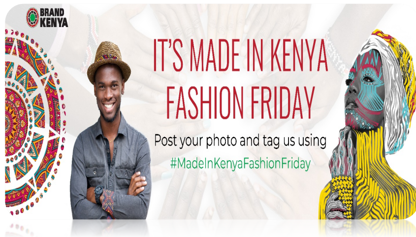
Figure 14: Promotion of 'Made in Kenya Fashion'.