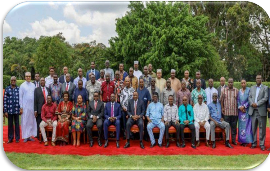
Figure 8: H.E. the President with Governors and Cabinet Secretaries during the 8th National and County Governments Coordination Summit at State House in February, 2020

of the ballooning public wage bill. The Summit resolved to among other things fast track the payment of pending bills in the counties, step up the fight against corruption, fast track finalization of the Disaster Risk Management and Digital Platform for Relief Assistance framework among others.