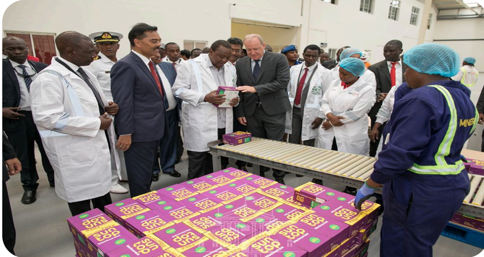
Figure 17: H.E. the President commissioning the BIDCO industrial park

Syokimau and Suswa terminus and the SGR freight services to the Naivasha Inland Container Depot.