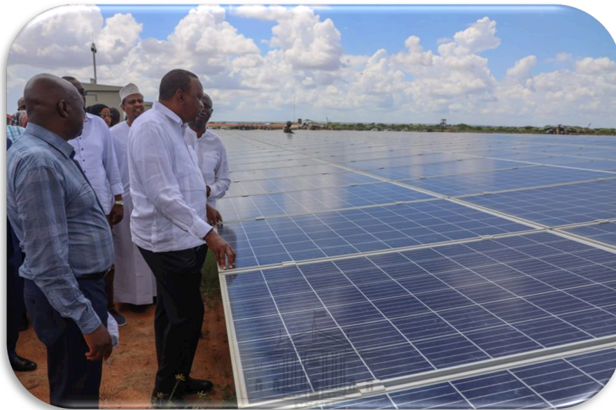
Figure 12: H.E the President commissioning the Garissa Solar plant

487. To promote the use of clean and renewable energy, H.E. the President commissioned a 54MW solar power farm in Garissa, the largest in East and Central Africa, putting Kenya on the path of achieving green energy sufficiency. The plant connected Garissa County and its environs to the national power grid.