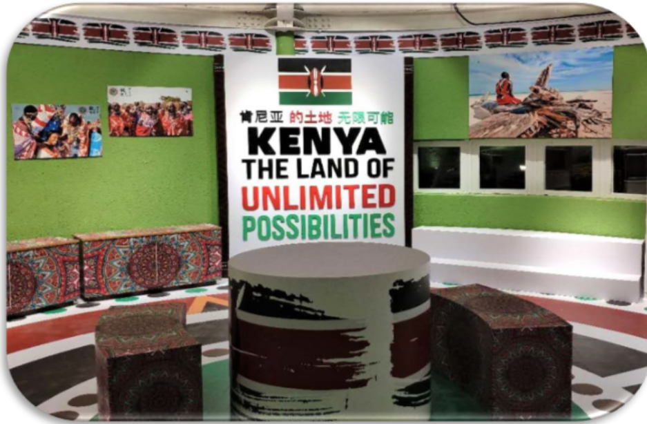
Figure 7: Kenya's pavilion at the 2019 horticultural expo in Beijing