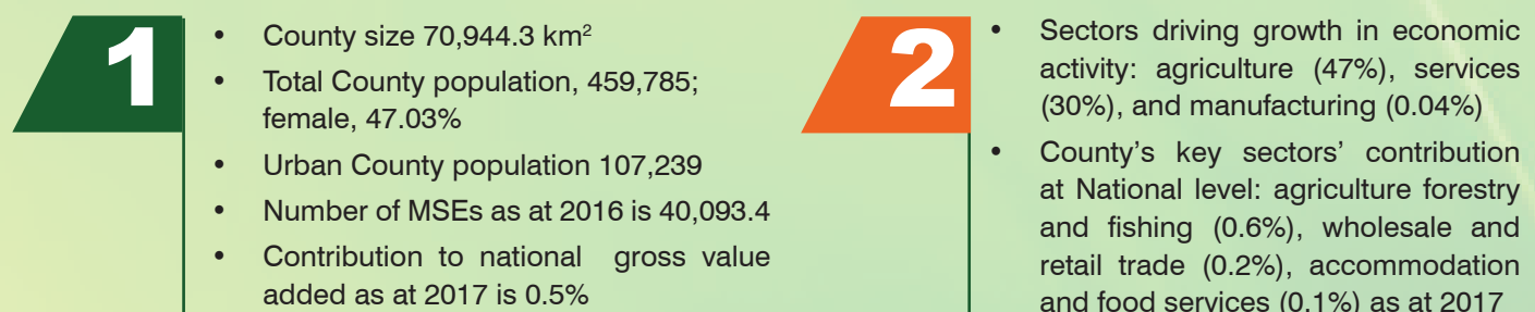
Figure 1: Marsabit County demographics and output

Further, two broad areas on financial inclusion and risk preparedness and management are included. This policy brief summarizes the MSEs business environment in Marsabit County, spotlights the related constraints, and highlights the relevant policy interventions. The research on the CBEM and associated output reported here demonstrate the role of KIPPRA, as a think tank and research intermediary, in fundamentally fostering the interconnectivity of research stakeholders in order to strengthen the research ecosystem in Kenya. This policy brief also exemplifies the role of KIPPRA in promoting research take-up to support the devolved system of government in Kenya.