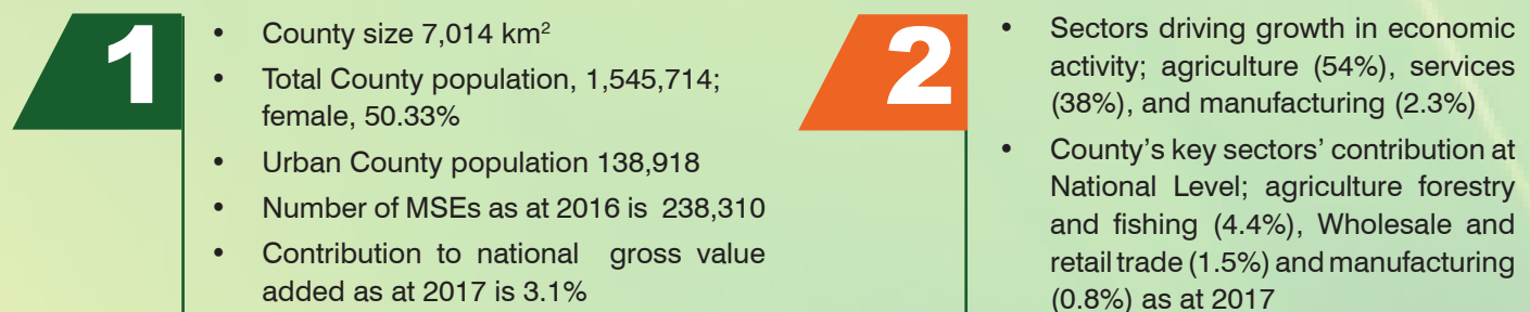
Figure 1: Meru County demographics and output

Further, two broad areas on financial inclusion and risk preparedness and management are included. This policy brief summarizes the MSEs business environment in Meru County, spotlights the related constraints, and highlights the relevant policy interventions. The research on the CBEM and associated output reported here demonstrate the role of KIPPRA, as a think tank and research intermediary, in fundamentally fostering the interconnectivity of research stakeholders in order to strengthen the research ecosystem in Kenya. This policy brief also exemplifies the role of KIPPRA in promoting research take-up to support the devolved system of government in Kenya.