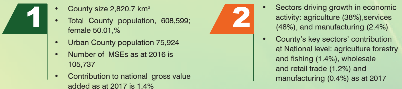
Figure 1: Embu County demographics and output

framework. Further, two broad areas on financial inclusion and risk preparedness and management are included. This policy brief summarizes the MSEs business environment in Embu County, spotlights the related constraints, and highlights the relevant policy interventions. The research on the CBEM and associated output reported here demonstrate the role of KIPPRA, as a think tank and research intermediary, in fundamentally fostering the interconnectivity of research stakeholders in order to strengthen the research ecosystem in Kenya. This policy brief also exemplifies the role of KIPPRA in promoting research take-up to support the devolved system of government in Kenya.