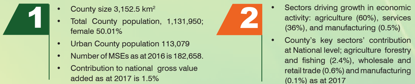
Figure 1: Homa Bay County demographics and output

Further, two broad areas on financial inclusion and risk preparedness and management are included. This policy brief summarizes the MSEs business environment in Homa Bay County, spotlights the related constraints, and highlights the relevant policy interventions. The research on the CBEM and associated output reported here demonstrate the role of KIPPRA, as a think tank and research intermediary, in fundamentally fostering the interconnectivity of research stakeholders in order to strengthen the research ecosystem in Kenya. This policy brief also exemplifies the role of KIPPRA in promoting research take-up to support the devolved system of government in Kenya.