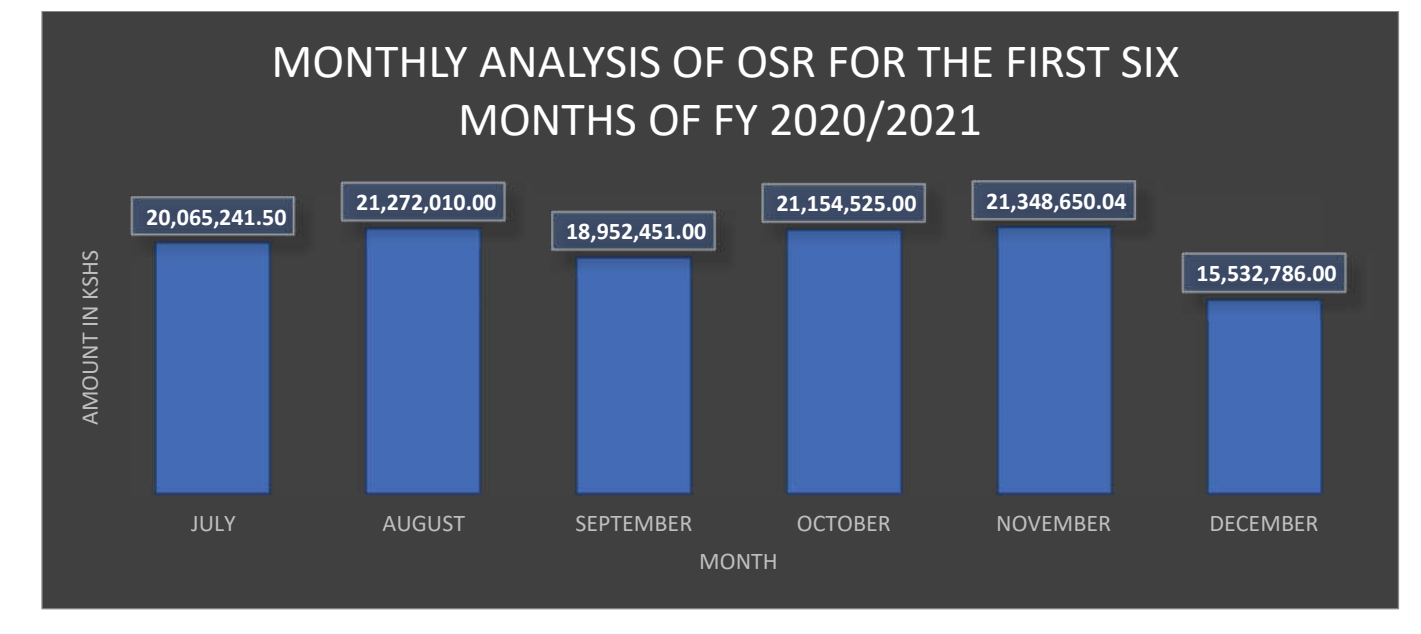
Figure 3: Monthly analysis of OSR for the first six months of FY 2020/2012

28.From the figure below the highest own source revenue collection was in the month of November and the lowest in the month of December. This is attributed to the socio-economic effect of the COVID 19 pandemic.