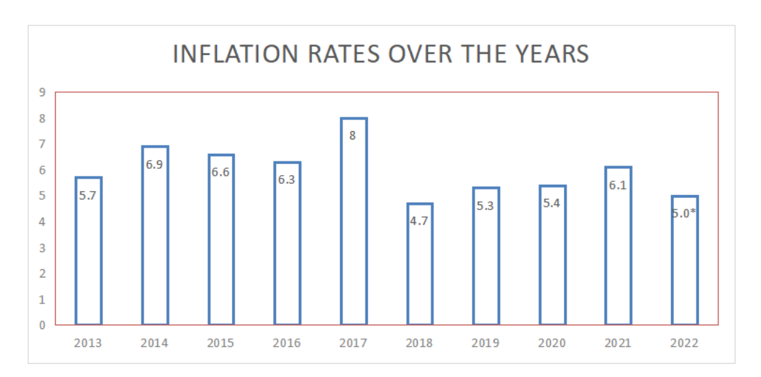
Figure 2.2: Trend in inflation rate over the years