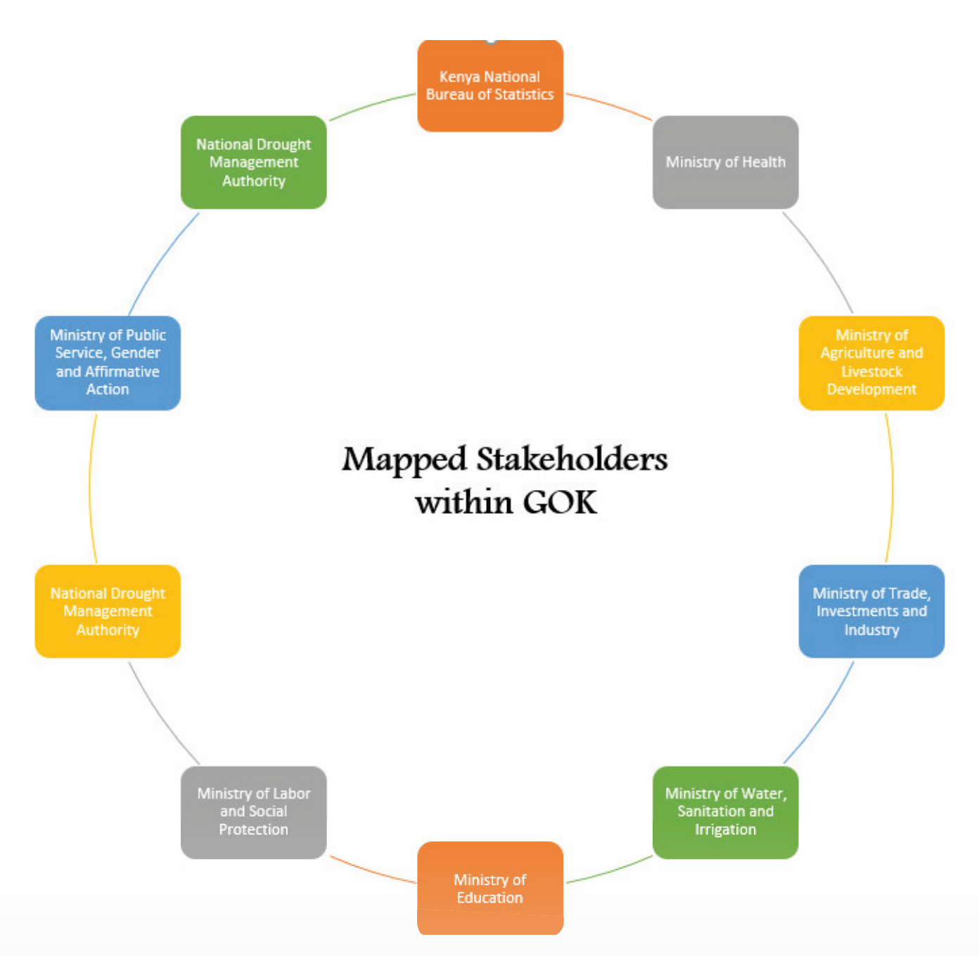
Figure 3: Stakeholders Mapped within Government of Kenya