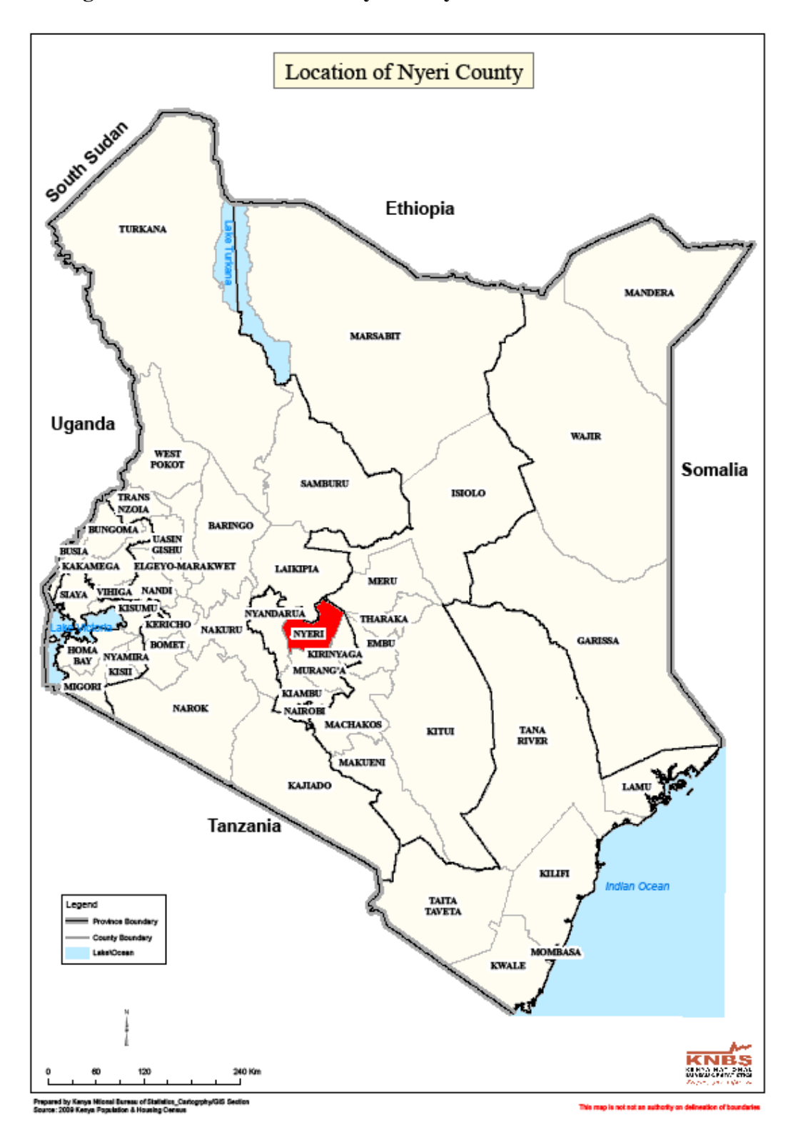
Figure 1: Location of the County in Kenya