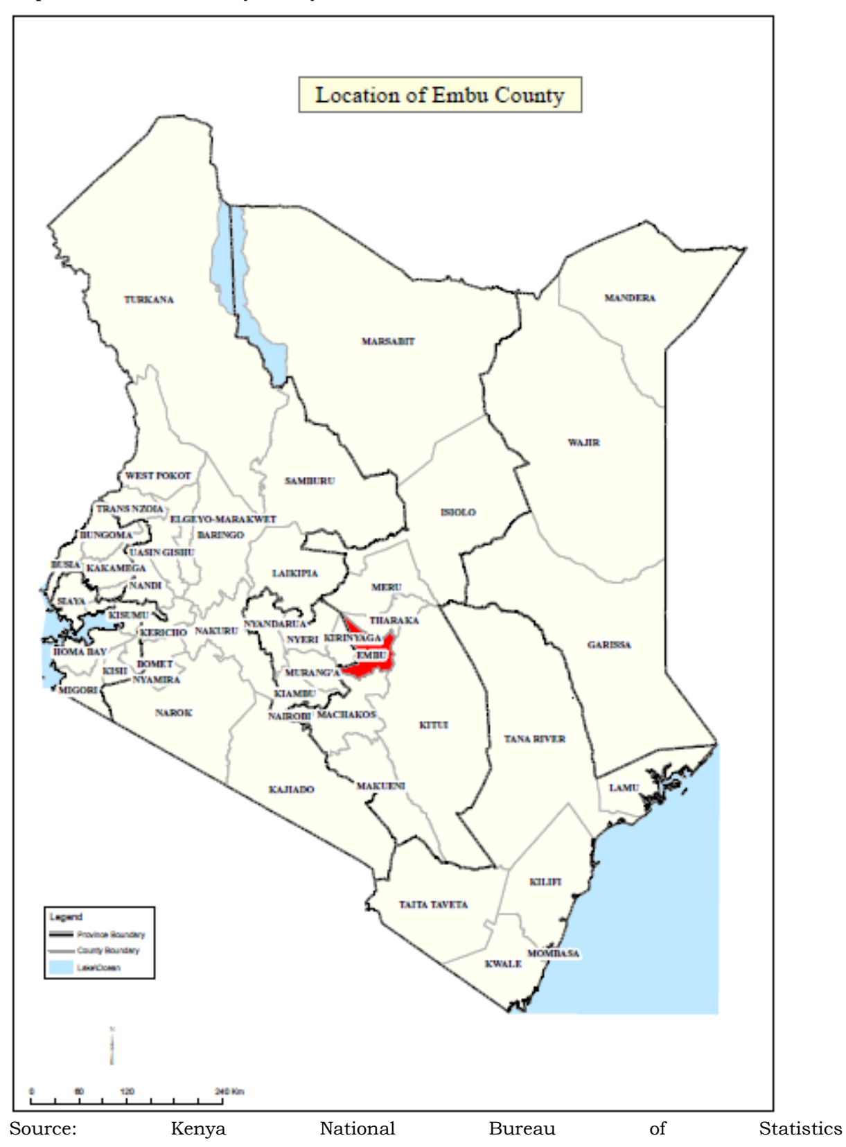
Map 1: Location of the County in Kenya