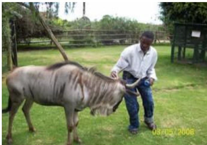
Figure 3: Wildlife in Tharaka Nithi County

Kinondoni Sales Service Lodge located Meru South is only tourist's class hotel. It is situated near Mt. Kenya forest and has a bed capacity of 40. Other Hotels include Transit Motel, Legacy Hotel, Baobab Hotel and Godka Hotel with bed capacities of 35, 52, 34 and 25 respectively. More hotels need to be established to meet the increasing number of tourists visiting the area. The county has got one eco-lodge, Kajuki eco-lodge.