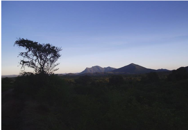
Figure 1: The Beautiful hills on the Tharaka Landscape-Kijege Hill to the left and Ntugi Hill to the right)