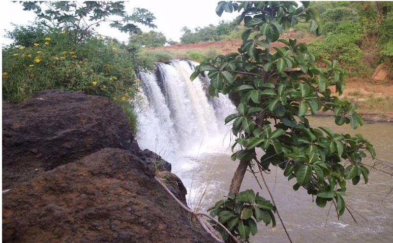
Figure 2: Gikwa Water Fall along Kathita River

The Ministry of Water and Irrigation, Ministry of Agriculture, and Kenya Forest Services in collaboration with NGOs in the county have been educating farmers on how to protect water catchment areas.