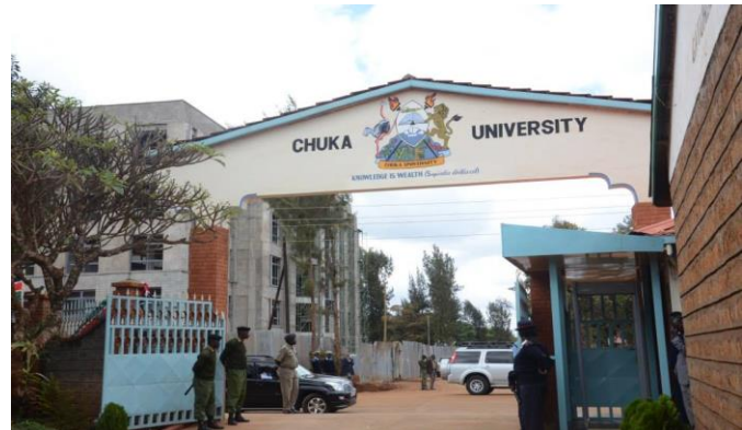
Figure 4: Chuka University in Tharaka Nithi County

because the enrollment level especially in secondary schools is very low. Employment of more teaching staff, provision of quality learning materials and up scaling the schools feeding programmers are necessary interventions to improve the learning situation.