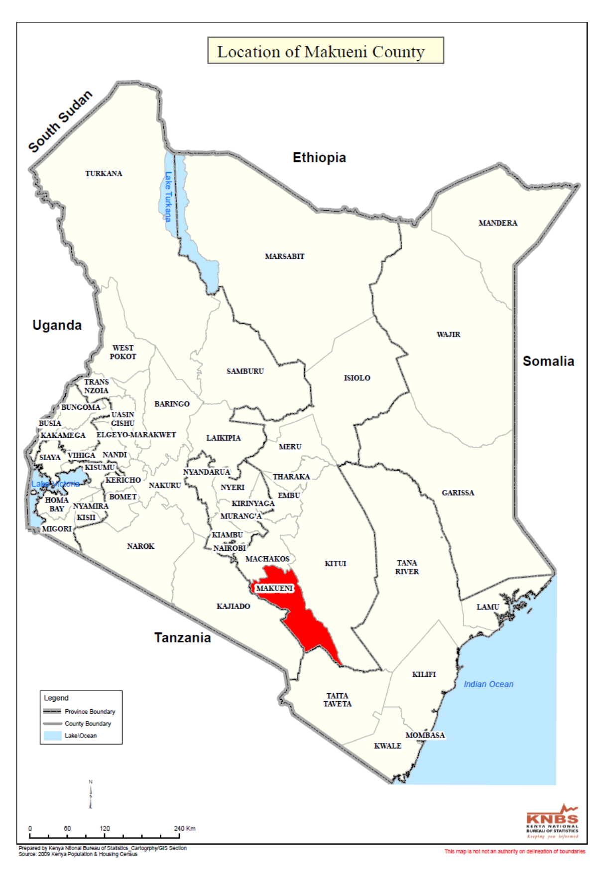
Map 1: Location of the County in Kenya