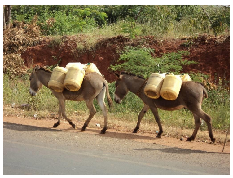
Donkeys transporting water in Wote Town

often do not hold sufficient water due to high evaporation rates during the dry seasons. The vast area of the county and the population is therefore inadequately supplied with water with the average distance from a water point high at 8kms. This has therefore led to severe water shortages for domestic, livestock, crop and industrial use. Being an ASAL region the county hardly receives sufficient rainfall. The ground water resources are low and saline because of the basement rock systems. This has greatly affected agricultural and livestock production as most farmers are forced to depend on rain fed agricultural production. The County should therefore improve access to water through sinking of boreholes in order to reduce the distance from a water sources. This will allow the county's residents to devote time to other economic disciplines rather than wasting much time in search of the precious commodity.