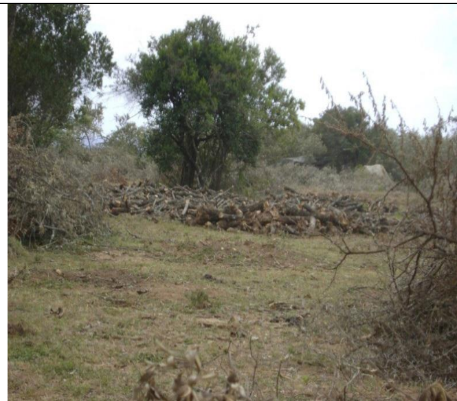
Logs for Firewood in Ilmashariani