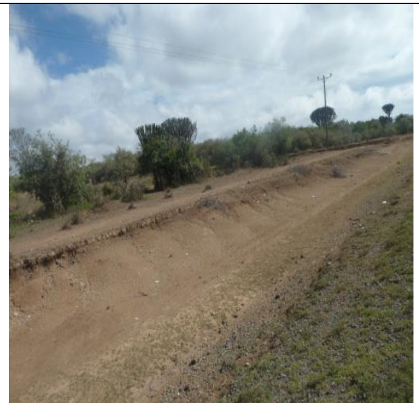
Erosion along C12 road to Ewuaso Ng'iro