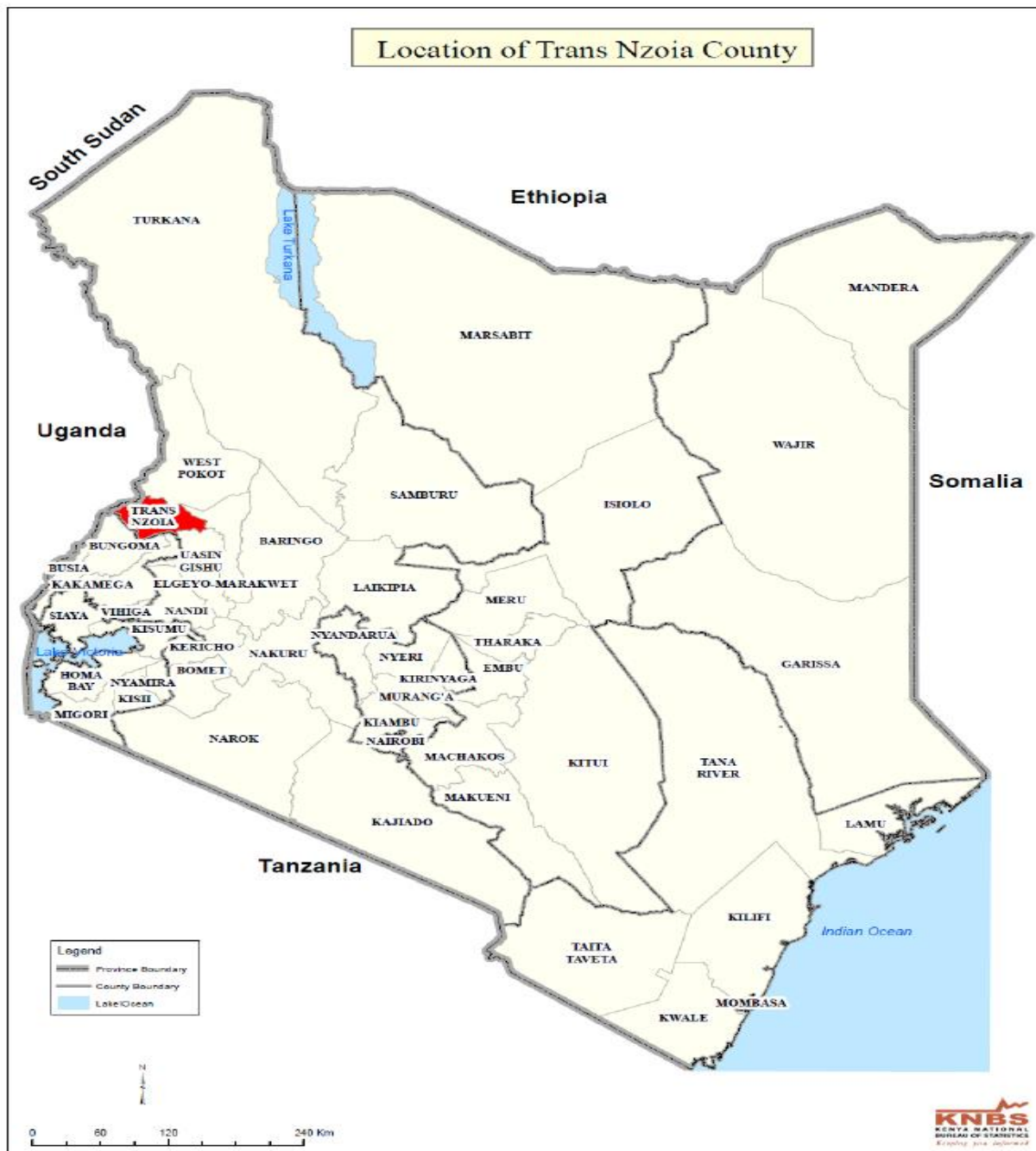
Map 1: Location of Trans Nzoia County in Kenya

Source: Kenya National Bureau of Statistics, 2013