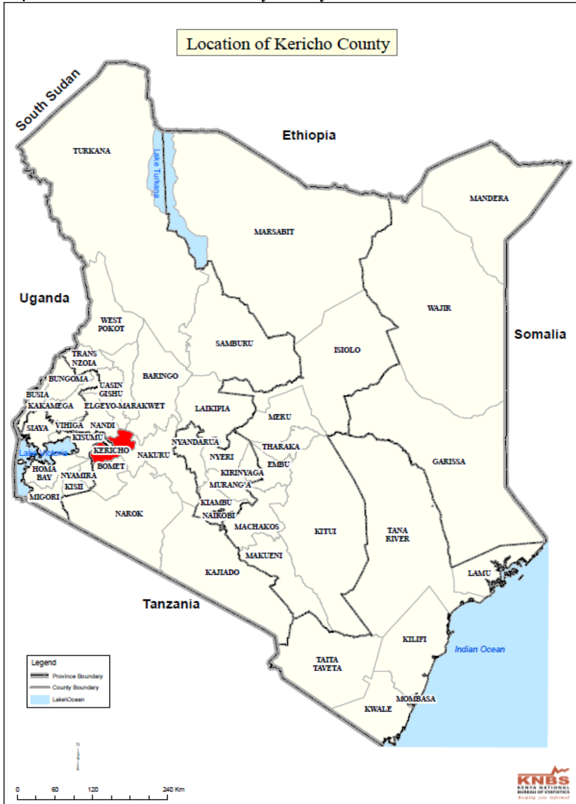
Map 1: Location of the Kericho County in Kenya