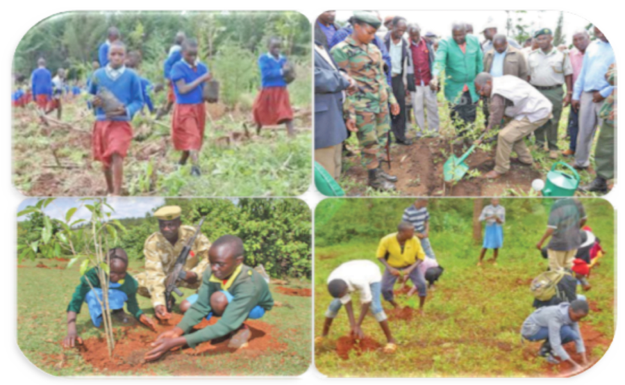
Figure 6: Rehabilitation of degraded natural forest areas

Corporation (KOFC) planted a total of 68,110 trees within KOFC land and donated 15,000 trees to nearby communities.