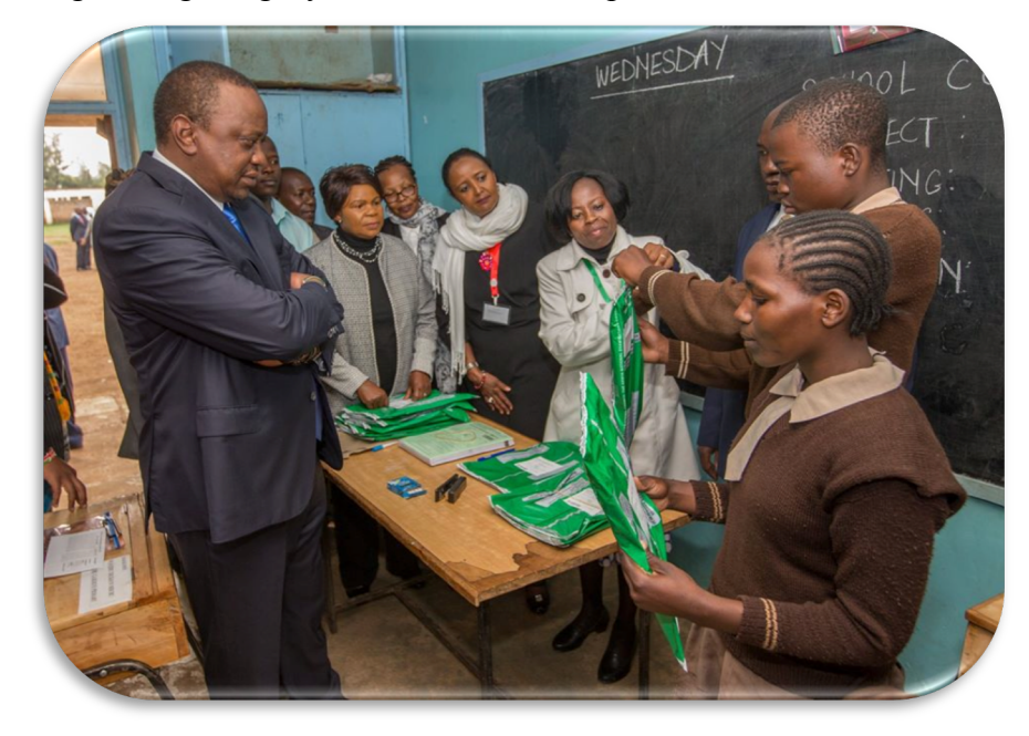
Figure 17: H.E. the President witnesses the opening of examination papers

establishment and implementation of robust mechanisms for safeguarding integrity of the examination process.