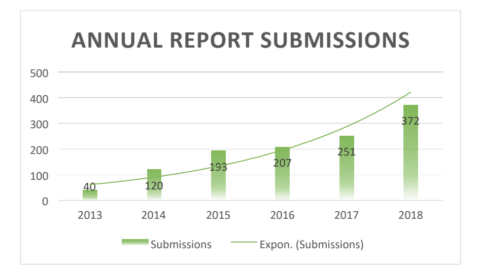
Figure 1: Reporting by public institutions since 2013

13. The Executive Office of the President through the Directorate of National Cohesion and Values received 372 reports from public institutions in 2019 compared to 251 in 2018, an increase of 121 submissions. The number of submissions in 2019 marked a tremendous increase in the number of reporting institutions from 40 in 2013 as illustrated in the table below. This increase could be attributed to the extensive training, advocacy and sensitization on national values and principles of governance undertaken by the Executive Office of the President.