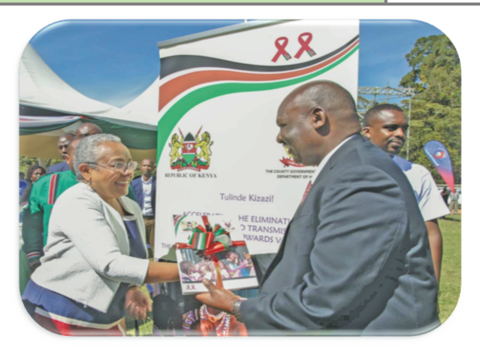
Figure 14: H.E. the First Lady launching Beyond Zero Mobile Safaris