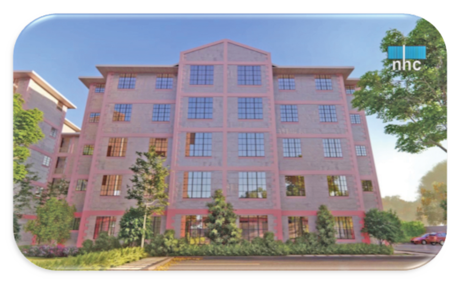
Figure 3: 250 Housing units in Kanyakwar, Kisumu County