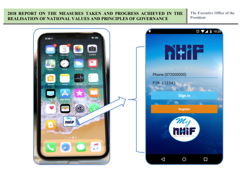
Figure 18: My NHIF application