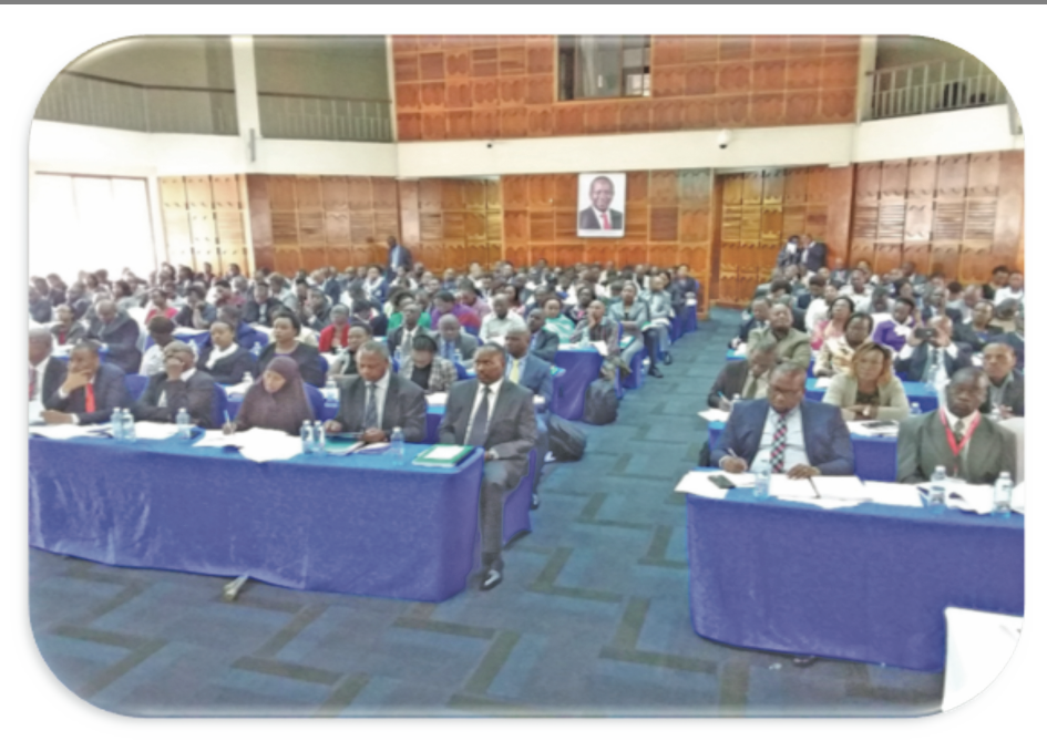
Figure 24: Validation of the 2018 Draft Annual Report