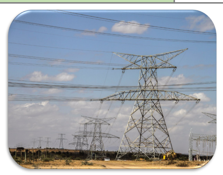
Figure 20: Newly installed high voltage power lines