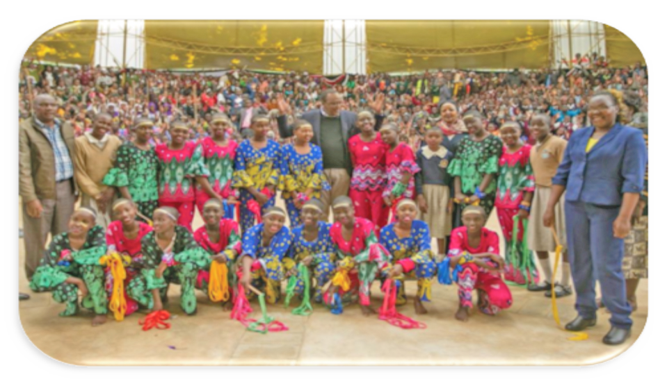
Figure 10: H.E. the President with participants of the National Music Festival