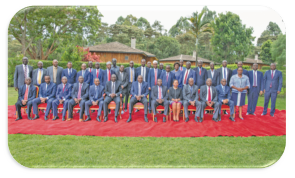
Figure 12: H.E. the President with Governors at the 6<sup>th</sup> Devolution Conference

257. To entrench sharing and devolution, the Council of Governors (COG) in collaboration with the Senate and other stakeholders held the 6<sup>th</sup> Annual Devolution Conference themed "Delivering. Transform. Measure. Remaining Accountable ". The forum took place at Kirinyaga University, Kirinyaga County from 4<sup>th</sup>-8<sup>th</sup> March, 2019 and brought together among others representatives from the two levels of government, independent commissions, academia, policy practitioners, civil society representatives, development partners and the media to reflect on the devolution journey and milestones achieved over the last five years and chart a way forward on how to make devolution successful.