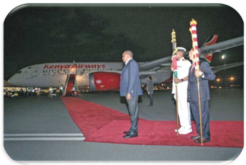
Figure 30: H.E. the President launches the direct flight to New York