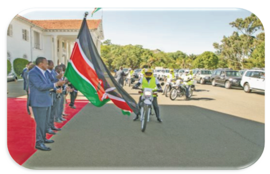
Figure 26: H.E. the President flags off Inua Jamii motor vehicles