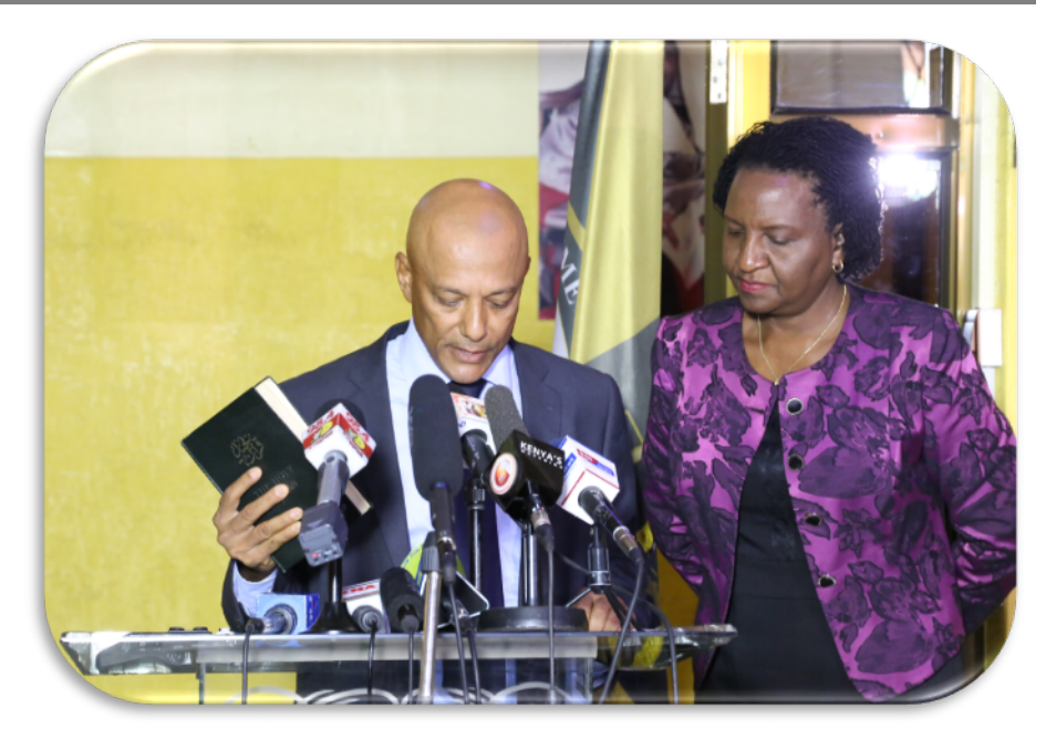
Figure 16: The EACC Chief Executive Officer being sworn into office