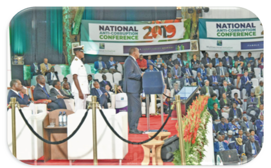
Figure 15: H.E. the President addressing the National Anti-Corruption Conference