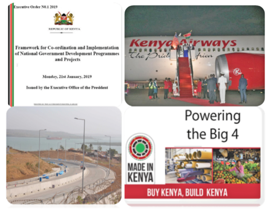
Figure 2: Aligning programmes, projects and activities to the Big 4 Agenda