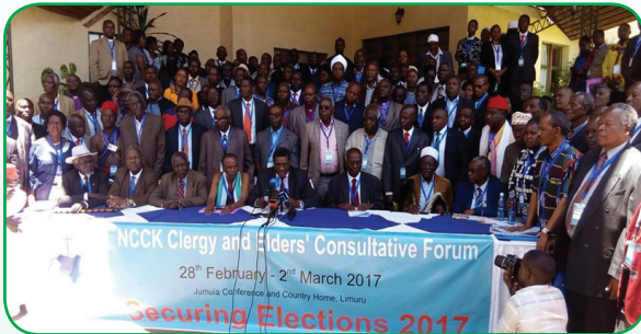
Wanainchi participate in decision making forums