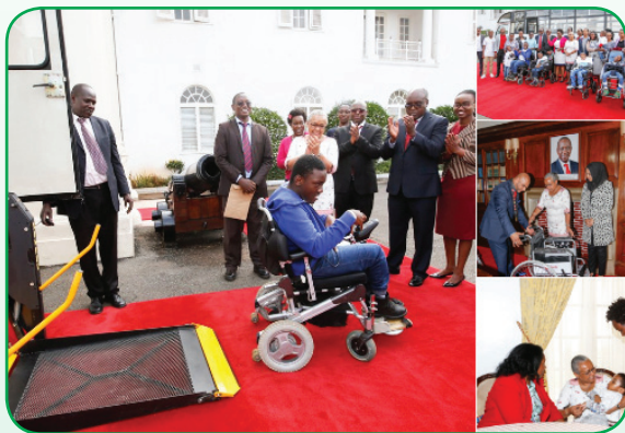
Beyond Zero Mobile Clinic

as spelt out in the Constitution and the Bill of Rights regardless of one's status ( Article 28 ).