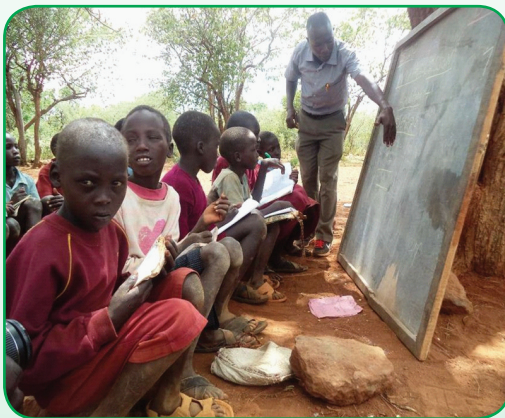
Pupils learning under a tree