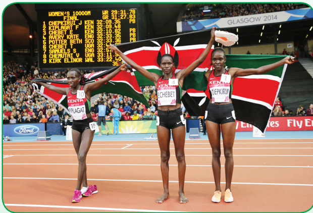
Kenyan athletes: The pride of the country over the years