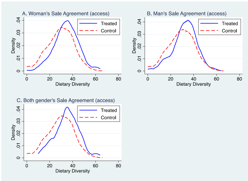
Figure 3: Kernel density distribution of dietary diversity by treatment group

In the case of either men's and women's market access treatment, we observed significant difference between treated and control groups for almost all the variables except household head in formal salaried employment and have tertiary education. However, for the combined treatment of both man and woman market access, no significant difference is found for self-employment, household size, age and secondary education between treated and control groups. In Figure 3, it can be seen that generally, treated groups have higher household dietary diversity score than the control groups. This is also confirmed in columns (3)-(5) of table 2.