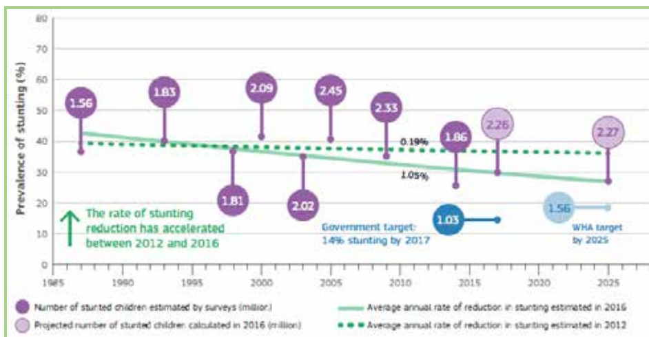
Appendix Figure 1: Trend, projection and targets in the prevalence and number of children (under-five) stunted in Kenya