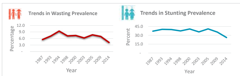
Figure 1: Percentage of stunted and wasted children under 5, 1987–2014