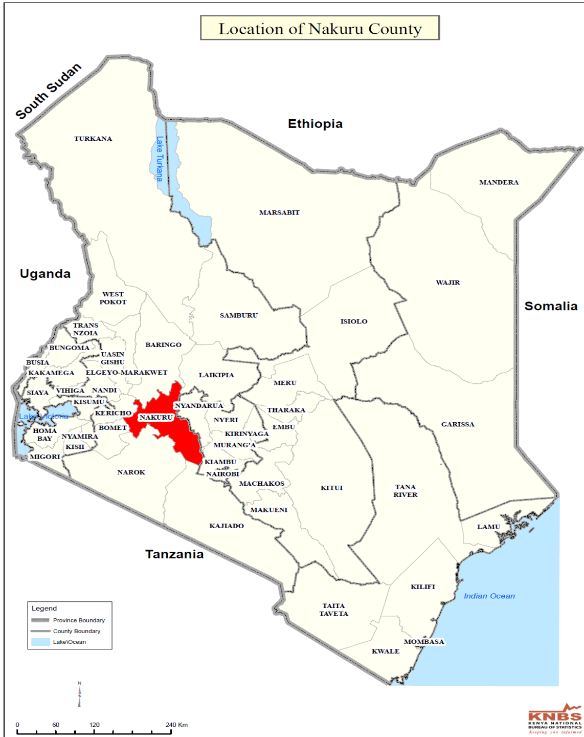
Plate 1.1: Location of the County in Kenya