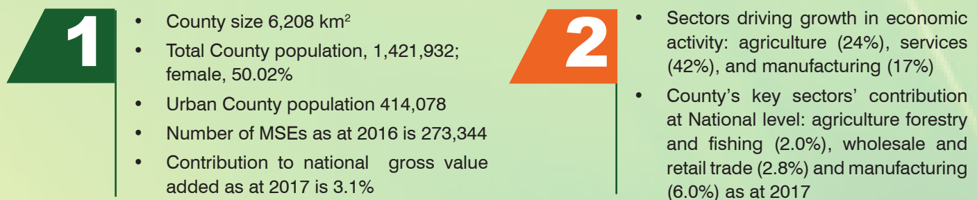
Figure 1: Machakos County demographics and output

Further, two broad areas on financial inclusion and risk preparedness and management are included. This policy brief summarizes the MSEs business environment in Machakos County, spotlights the related constraints, and highlights the relevant policy interventions. The research on the CBEM and associated output reported here demonstrate the role of KIPPRA, as a think tank and research intermediary, in fundamentally fostering the interconnectivity of research stakeholders in order to strengthen the research ecosystem in Kenya. This policy brief also exemplifies the role of KIPPRA in promoting research take-up to support the devolved system of government in Kenya.