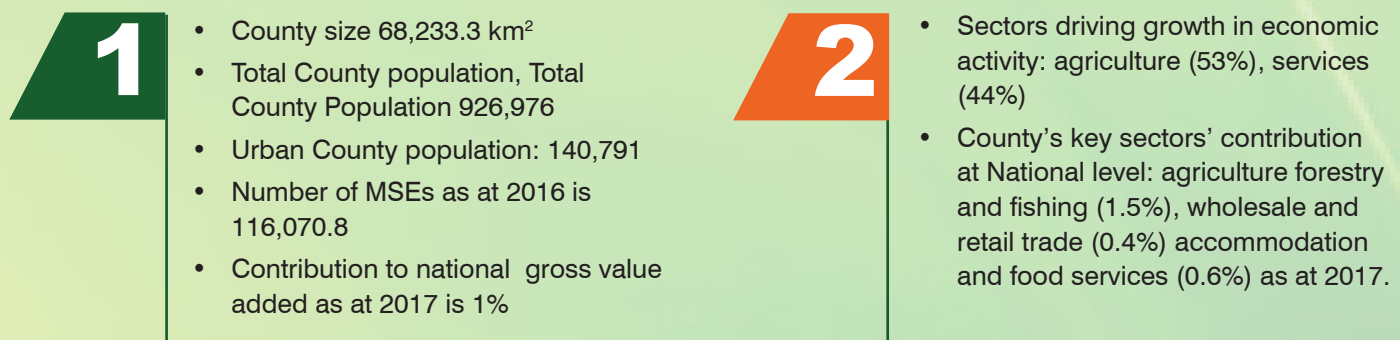
Figure 1: Turkana County demographics and output

Further, two broad areas on financial inclusion and risk preparedness and management are included. This policy brief summarizes the MSEs business environment in Turkana County, spotlights the related constraints, and highlights the relevant policy interventions. The research on the CBEM and associated output reported here demonstrate the role of KIPPRA, as a think tank and research intermediary, in fundamentally fostering the interconnectivity of research stakeholders in order to strengthen the research ecosystem in Kenya. This policy brief also exemplifies the role of KIPPRA in promoting research take-up to support the devolved system of government in Kenya