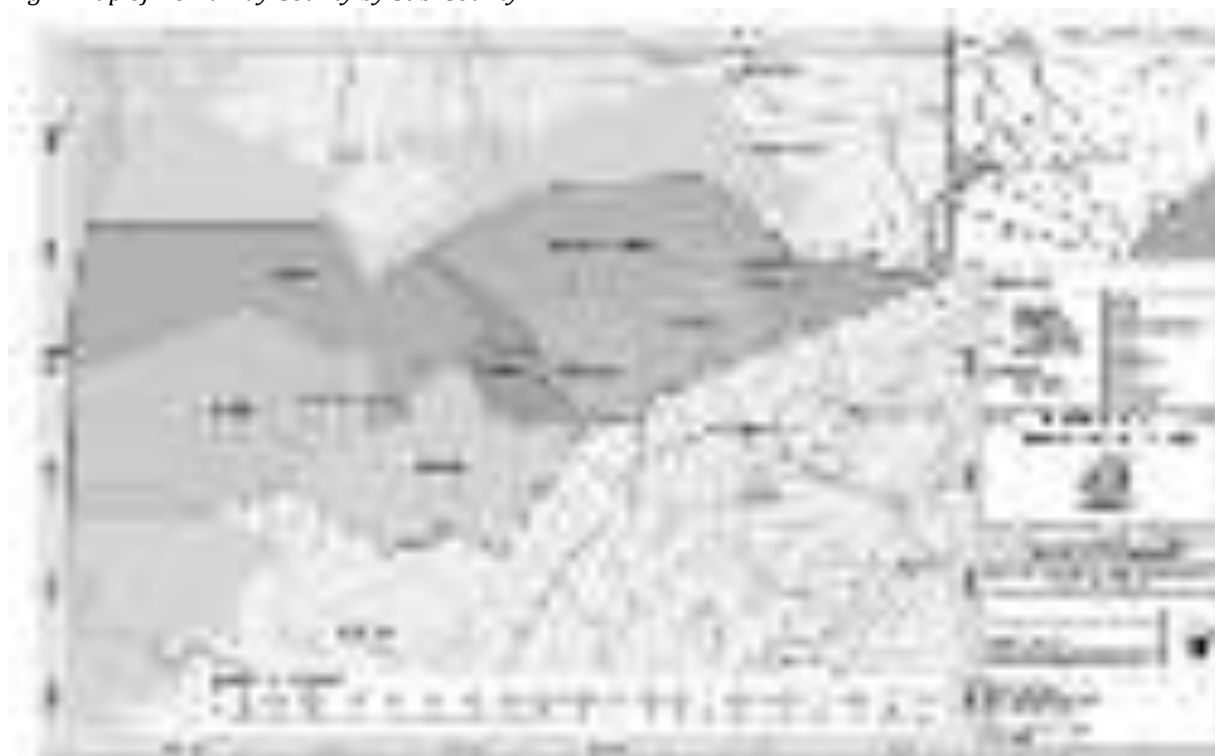
Fig. 1 Map of Homa Bay County by Sub-County