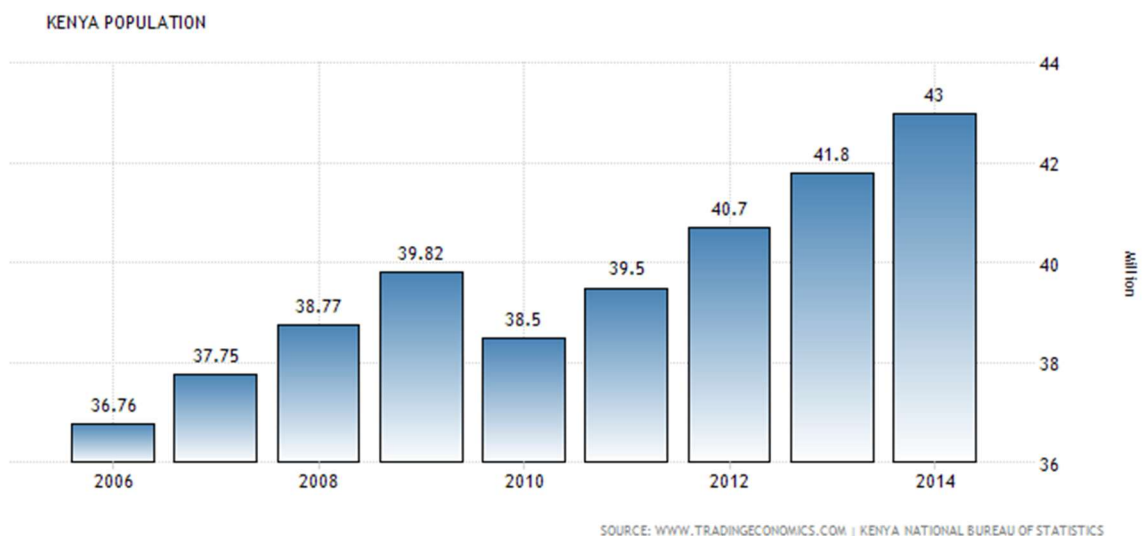
Figure 1: Population Trends and Projections 2006-2014

A rapidly expanding population continues to put pressure on the already strained housing situation in Kenya. Demographic indicators for 1960 to 2014 show that Kenya had a population of 8.1 million people in 1960 as compared to an estimated population of 43.0 million people in 2014.