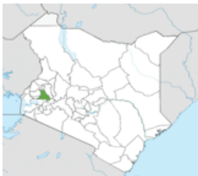
BELOW IS A POLITICAL MAP OF THE TRANSNZOIA COUNTY

ADMINISTRATIVELY, THE COUNTY COMPRISES OF THREE ADMINISTRATIVE SUB COUNTIES NAMEDLY TRANS NZOIA WEST, TRANS NZOIA EAST AND KWANZA THAT ARE FURTHER SUBDIVIDED INTO EIGHT DIVISIONS AND THIRTY EIGHT LOCATIONS. POLITICALLY, TRANS NZOIA COUNTY HAS FIVE CONSTITUENCIES NAMEDLY ENDEBESS, CHERANGANY, SABOTI, KWANZA AND KIMININI WHICH ARE BROKEN DOWN INTO TWENTY FIVE COUNTY ELECTORAL WARDS