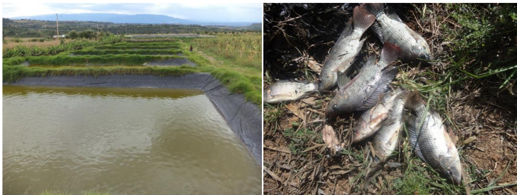
Some of the Fish farming projects introduced under the ESP with the result of the harvests made.

main types of fish reared are tilapia, cat fish and tout though at low level. There are three landing site on Lake Naivasha, Kamere, Central landing and Tarambeta each with fish market centres/bandas. Also one landing site on every dam that is being exploited. There has been a notable increase in fish production both from the capture fisheries and culture in ponds which has greatly increased the consumption of fish within the county. This calls for an organized market with proper fish handling facilities constructed in other parts of the county like Nakuru and Subukia to reduce post-harvest losses.