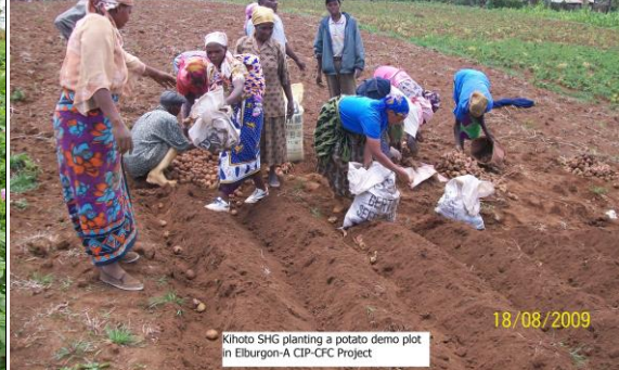
Kihoto SHG planting a potato demo plot in Elburgon-A CIP-CFC Project