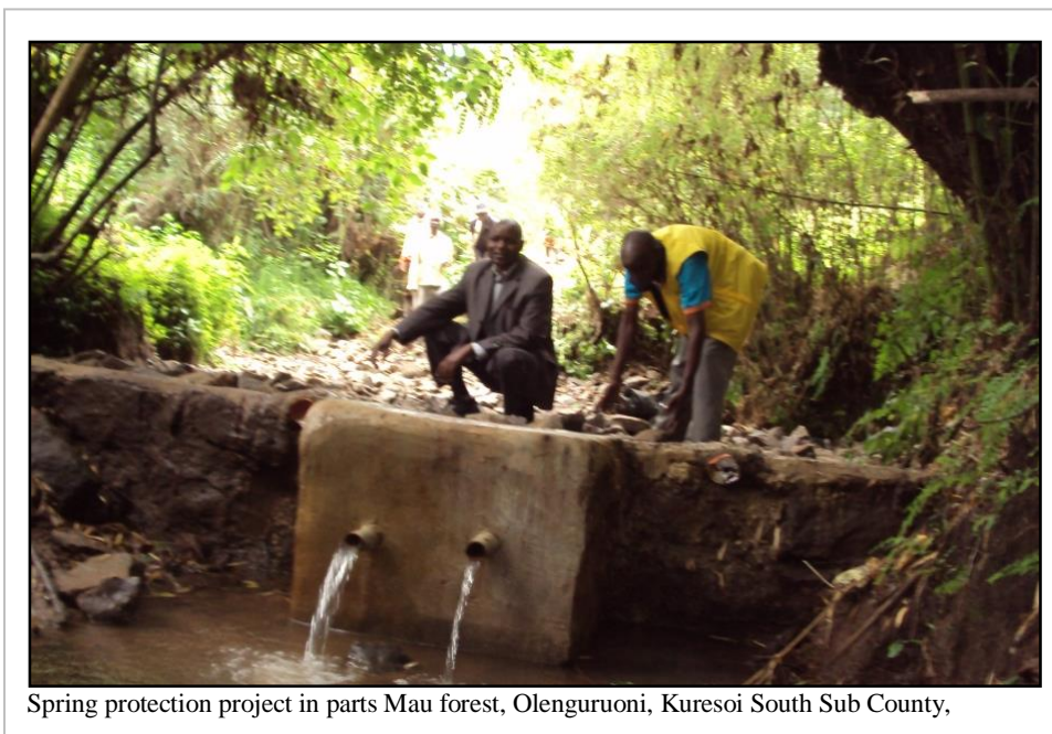
Spring protection project in parts Mau forest, Olenguruoni, Kuresoi South Sub County,

The distance to the nearest water point in Nakuru County is from zero to six kilometres. Thirty five percent of the county population take between 1-4 minutes to fetch drinking water. Estimates from KPHC 2009 indicate that about 150,608 households (36.8 per cent) in the county have access to piped water. About 63 per cent have access to potable water. 80 per cent of household are harvesting rainwater.