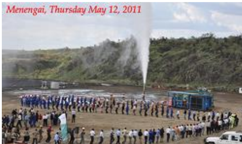
Geothermal Energy Power Project at Menengai.

Nakuru County occupies a strategic geographical location at the floor of the Rift Valley which has seismic activities and therefore promotes the production of geothermal power at Olkaria, Menengai Crater and Ol Doinyo Eburru geothermal projects. Exploiting the full potentials of geothermal energy shall hugely improve the realisation of affordable energy and reduce over-reliance on hydro-power which is susceptible to climate change.