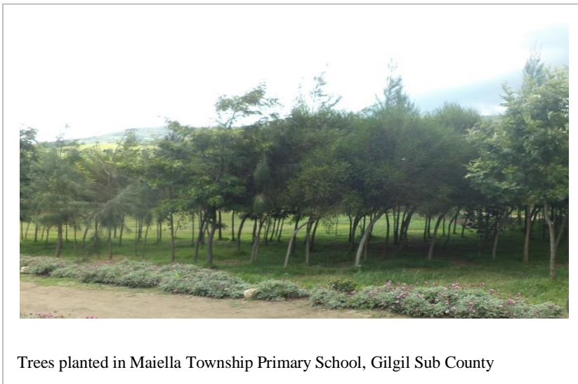
Trees planted in Maiella Township Primary School, Gilgil Sub County

The beautification programme has been ongoing through tree planting and gardening projects in major towns in the County. The Municipal Council of Nakuru in collaboration with Danish government has been involved in the beautification of the main street in the town as part of improving its aesthetic value. Njoro Town also benefitted from a tree and flower beautification project under the Kazi Kwa Vijana Programme.