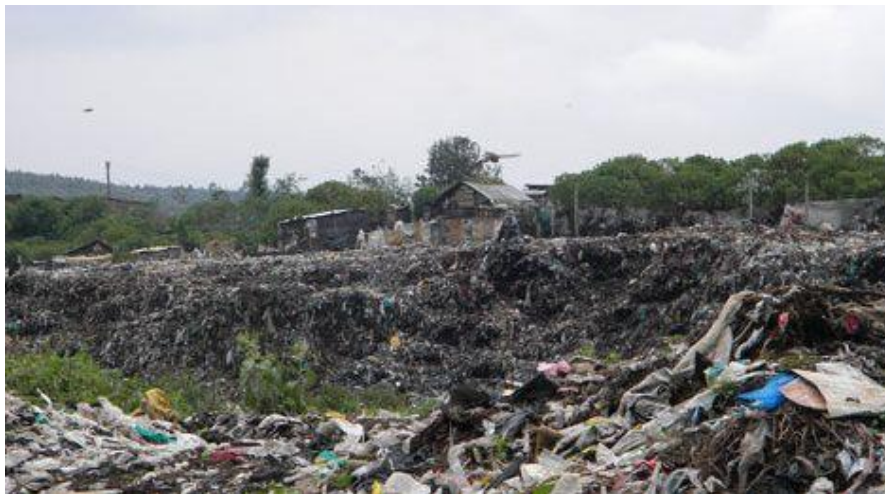
Solid waste disposal in the upstream at the Nakuru's Goto dumpsite is a major contributor of environmental pollution and degradation

Environmental degradation in Nakuru County is mainly as a result of inappropriate farming methods, effects of climate change, poor solid waste and liquid waste disposal, soil erosion, inadequate sanitary facilities, massive felling of trees for firewood, timber and clearing land for agricultural use. In addition, poor physical planning in urban areas, quarrying activities, pollution and toxic from agro-chemicals contributes to environmental degradation.