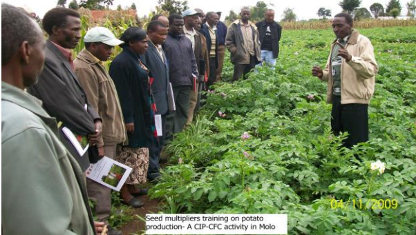
Seed multipliers training on potato production- A CIP-CFC activity in Molo