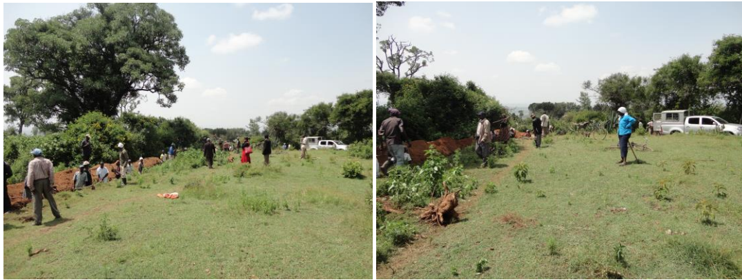
Community Contribution through manual labour service in the constructing a water canal for irrigation in Njoro Sub County

The land area under food crops and cash crops in Nakuru County is 243,711.06 (Ha) and 71,416.35 (Ha) respectively covering approximately 3,151.240 Km 2 of the total area of the county. A number of factors have contributed to the increase in land under cultivation namely; the rich volcanic soils of Nakuru County that give great potential for crops, reliable rainfall in most parts of the county, readily available labour force and the availability of ready market for crop produce both in the urban centres and the proximity to other major urban centres such as Nairobi, Naivasha, Gilgil and Narok which offers incentives for the sector to flourish. There is however a substantial size of land in the county that is either arid or semi-arid but can be made productive through irrigation. The County share the national Vision of increasing land under cultivation through sustainable irrigation projects.