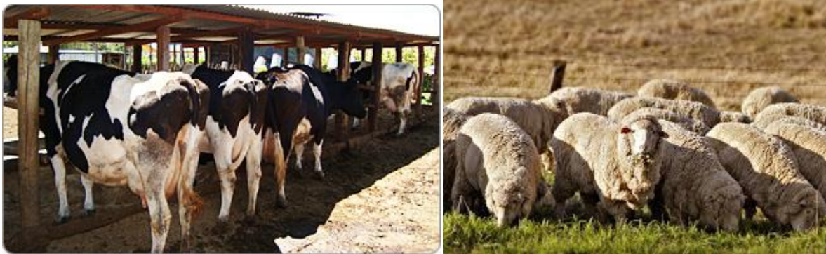
Dairy farming and Sheep farming in the County are a great potential for economic growth and development

Livestock production is one of the major economic and social activities undertaken by communities living within Nakuru County. The main livestock reared, in order of economic significance, include: Dairy cattle, poultry, sheep, goats, beekeeping and rabbits. Among them, dairy production is a major livestock income earner. Other includes the emerging livestock species such as Quails, Pigeon and Ostrich. The main livestock breeds include Dairy-Ayrshire, Friesian, Guernsey and Jersey and several crosses. Beef animals they include Boran, Sahiwal and their crosses. Goats breed are East African goat, Saanen, Torgenburg, German Alpine, Galla, Boer and Angora. Sheep breeds include Merinos, Blackhead Dorper, Corriedale, Romney Mash and Hampshire down. Pig breeds include Landrace, Large white, Duroc and their crosses. For poultry we have commercial breeds such as White Leghorn, Rhode island, Light Sussex, Black Australorp and the hybrids. For indigenous they include Normal, crested, naked neck, dwarf and frizzle available as types.