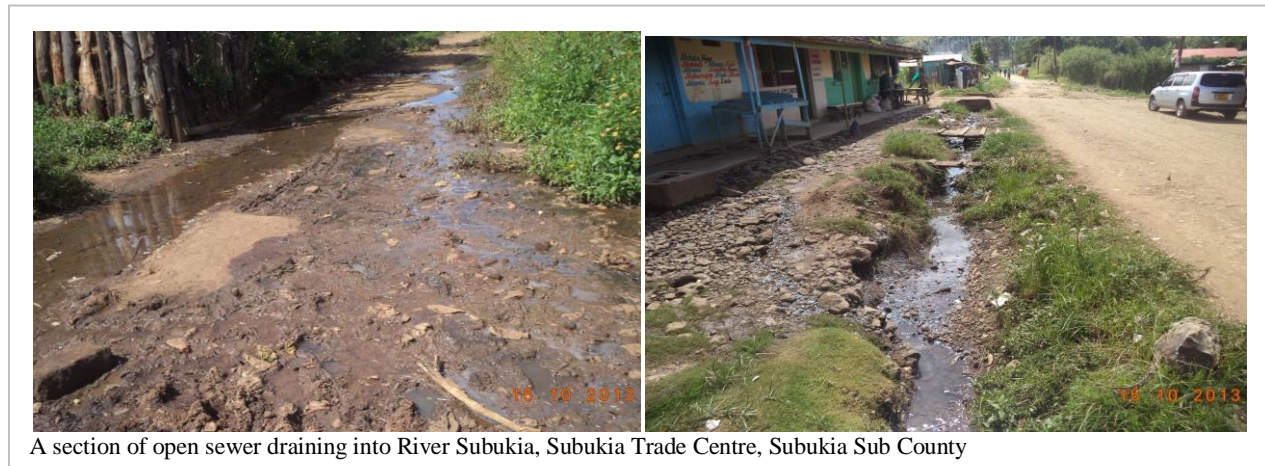
A section of open sewer draining into River Subukia, Subukia Trade Centre, Subukia Sub County

sanitation and poor management of both solid and liquid waste. There will be need therefore, for enhanced measures to ensure proper physical planning and management of waste disposal in the county.