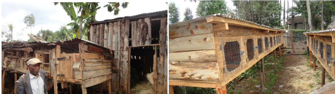
Rabbit house before and after a government led rabbit support project in Molo Sub County