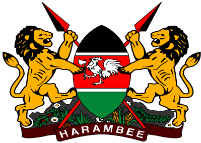
Republic of Kenya