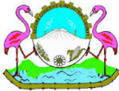
Nakuru County Government

Nakuru County Sessional Paper No.....of 2019